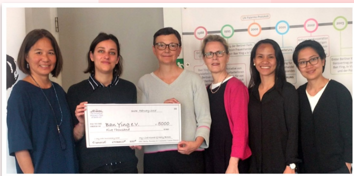
Ban Ying was recipient of the benefit performances of Eve Ensler's "The Vagina Monologues" at the English Theater Berlin in February 2018, as part of the 20th anniversary celebration of "V-Day", Eve Ensler's global campaign to end violence against women and girls.

Ban Ying e.V. | Anklamer Str. 38 10115 Berlin | 030/440 63 73 beratung@ban-ying.de ; caguioa-moennich@ban-ying.de